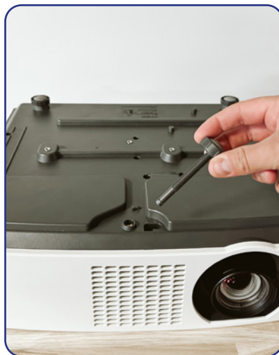
5. Remove the projector's front leg (Skip this if VMZ7ST or VMZ6ST)