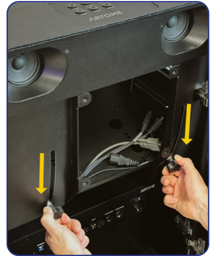
3. Lock the angle adjustment to the Bottom position