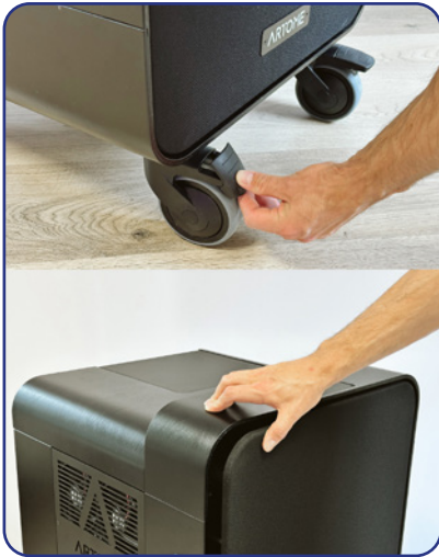
1. Lock the wheels and open the front door