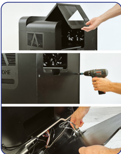
4. Open the lens latch. Remove the back cover (HEX4) and disconnect the pass-through cables